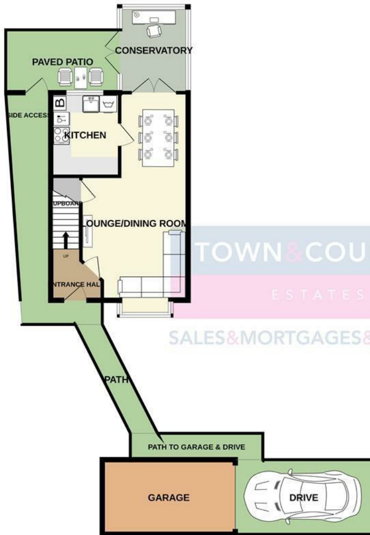
GROUND FLOOR 559 sq.ft. (51.9 sq.m.) approx.